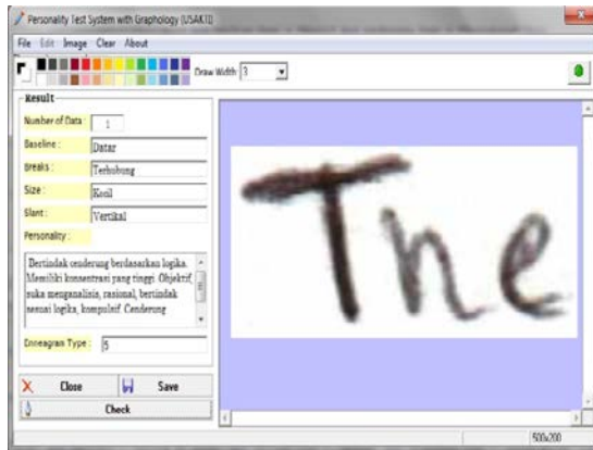
Figure 8. Handwriting Analysis Menu