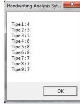
Figure 7. Weight Results of Enneagram

each image, where the value of '0' will be given if the representation of the grid is the background object, and a value of '1' if the representation of the grid is a foreground object with a minimum of 15% of total pixels of each grid is a foreground object [1].